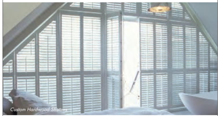
Incredible Savings, Promotions, and Upgrades On Shutters & More Going On Now!* Contact your local Style Consultant for amazing offers in your area!

Schedule your FREE Consultation today! 925-216-4857 //BudgetBlinds.com